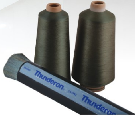
CONDUCTIVE YARN & FIBERS