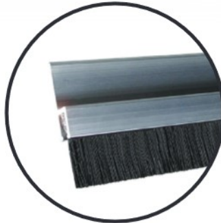
ESD Strip Brush