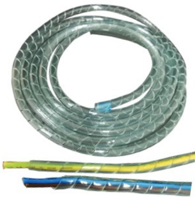
ESD SPIRAL WRAP