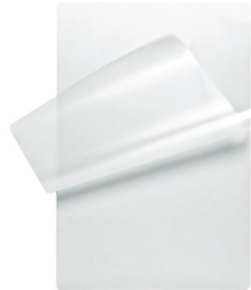
ESD A4 LAMINATED SHEET